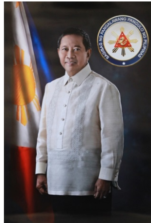
H.E. Jejomar Binay, Sr. Former Vice President, The Philippines

His Excellency Jejomar “Jojo” Cabauatan Binay, Sr. was Vice President of the Philippines from 2010 to 2016, serving under President Benigno Aquino III. Following a distinguished career in law, H.E. Binay served as Mayor of Makati City for six terms, from 1988-1998 and 2001-2010. He was a presidential candidate in the 2016 Philippine presidential elections.