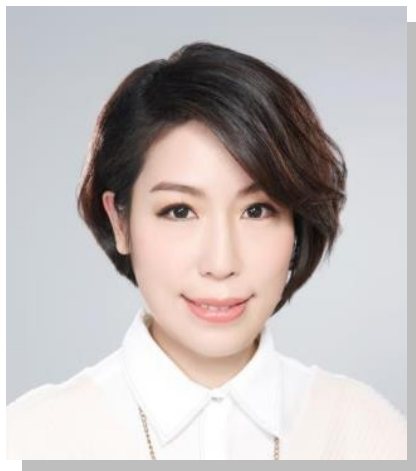
Hon. Karen Wan-ju Yu Legislator, R.O.C. (Taiwan)

Yu wan-Ju (Karen) is a Taiwanese politician currently serving as a legislator. She was nominated by the DPP (Democratic Progressive Party) to be a candidate in the 2016 legislative election and was elected as a legislator-at-large-seat.